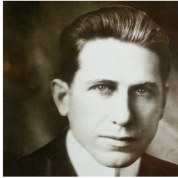
James Oliver Curwood

James Oliver Curwood was born here in Owosso in the back of his father's cobbler shop. He started writing at the age of nine on any scrap of paper he could find. As he grew up so did his stories. His little short stories grew up into adult action - adventure novels. In the age before television, books were the staples of entertainment for families. Mr. Curwood's stories, containing such characters as Canadian Mounties & wild animals, were set in the Yukon, Canada, & Alaska were highly anticipated. There were over 230 movies that were made from his stories.